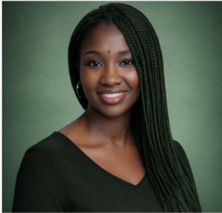
A WORD FROM OUR DIRECTOR